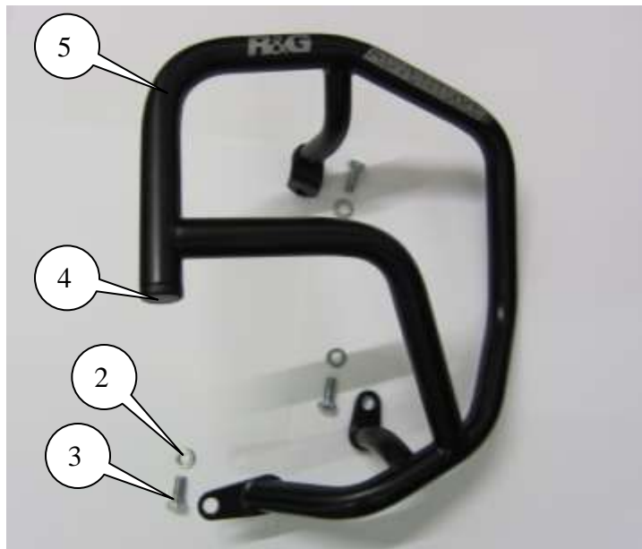
RIGHT HAND SIDE

THIS KIT CONTAINS THE ITEMS PICTURED AND LABELLED BELOW. DO NOT PROCEED UNTIL YOU ARE SURE ALL PARTS ARE PRESENT.