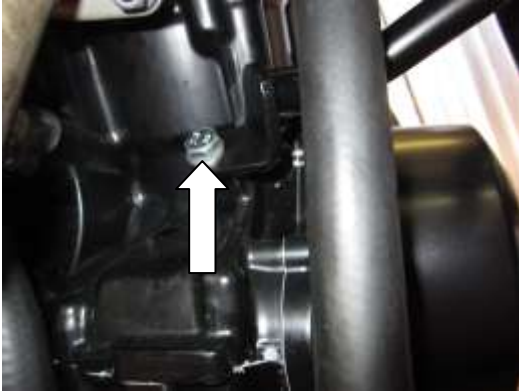
3. PICTURE THREE