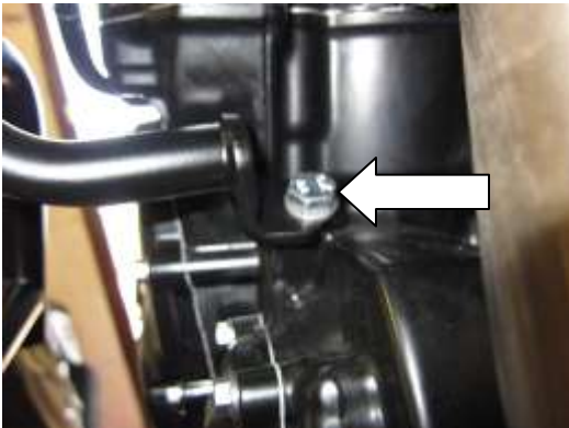
5. PICTURE FIVE